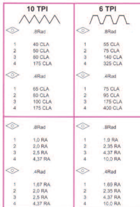
Table of Surfacing Feeds